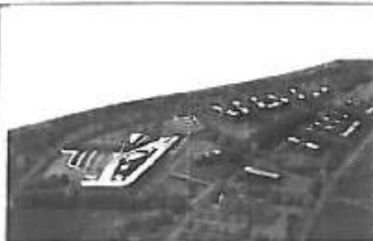
The new Inverness College.

Development of the earlier site by the railway line was not welcomed by Highlands and Island Enterprise because of its location to the site of the new Inverness College. The creation of the new campus to the south of the main railway line has started on site and looks like this: