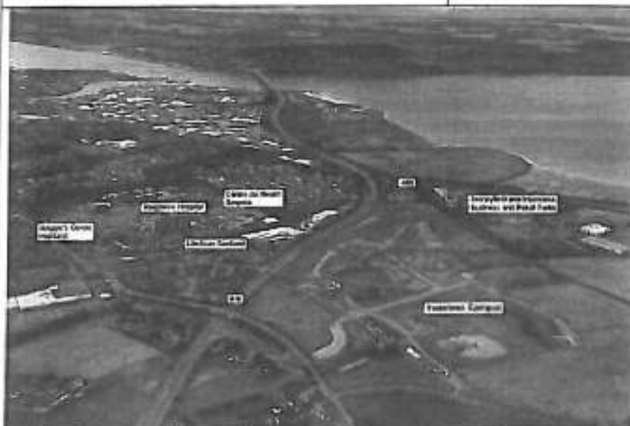
Work underway at the new Inverness Campus.