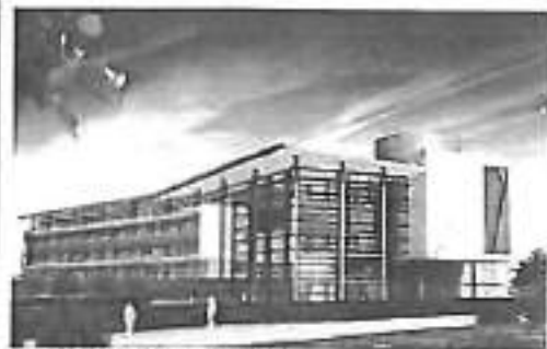
The new Inverness College